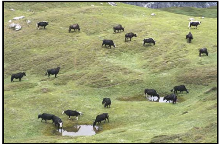
Yongzokdrak meadows packed with Dzos

During the Winter Habitat Survey conducted in January 2006, the survey team came across a trap laid for snaring blue sheep using salt as bait at Yangzee.