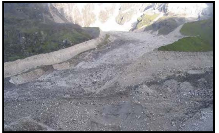
Receding Onglaktang Glacier

There are a number of glaciers originating from the Gochela, Kabur, Pandim, Narsing and Tingchen Khang. The affects of global climate change can be detected in the retreat of these glaciers, and now there are huge boulders, stones and chunks of ice along the glaciated valleys.