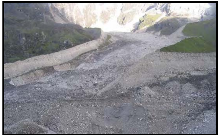
Receding Onglaktang Glacier

There are a number of glaciers originating from the Gochela, Kabur, Pandim, Narsing and Tingchen Khang. The affects of global climate change can be detected in the retreat of these glaciers, and now there are huge boulders, stones and chunks of ice along the glaciated valleys.