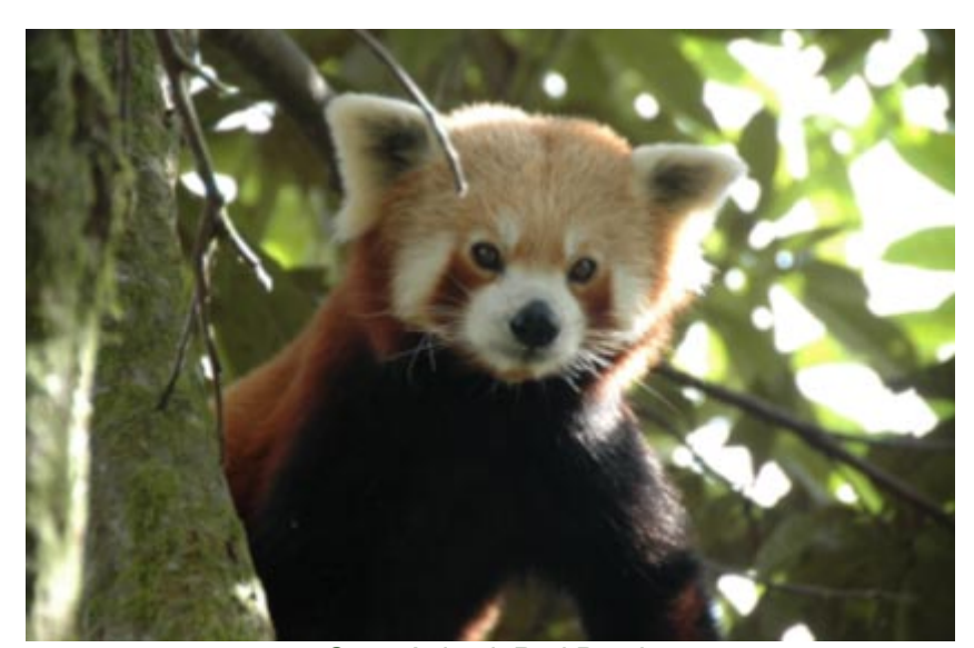
State Animal: Red Panda