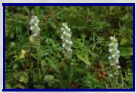
Satyrium nepalense var.ciliatum at 3132m (E.Sikkim): Threatened

Distribution: E. Sikkim: Tsomgo lake catchment area, 3185m;11-09-2007 Specimen studied: SAHOO, A.K. 29692(BSHC-6 nos).