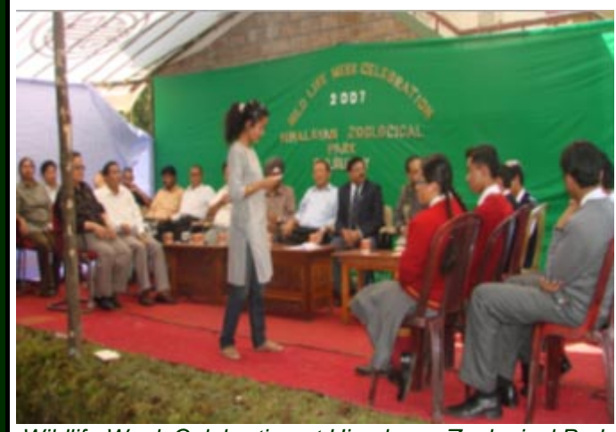
Wildlife Week Celebration at Himalayan Zoological Park