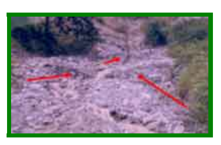
Shifting of landmass has been partially protected against heavy runoff by sausage wall