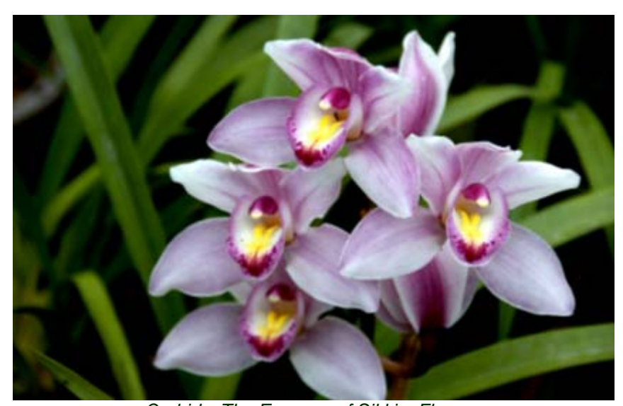
Orchids: The Essence of Sikkim Flowers