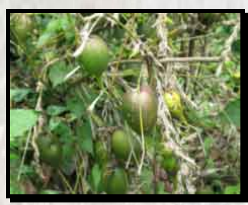
Melocanna baccifera (Philimbans)

The species endemic to particular areas, these may be protected in-situ by creation of gene sanctuaries. For e.g. the Sinarundinaria microphylla (Deonigalo) is found in Deonigalee Dap of West Sikkim. The area of occurrence need to be surveyed to pinpoint the habitats and should be conserved by creating gene sanctuaries of bamboos.