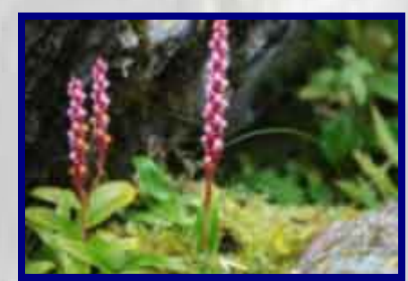
Satyrium nepalense var. nepalense at 3185 m (E.Sikkim): Common