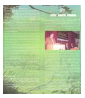
State Green Mission Pamphlet