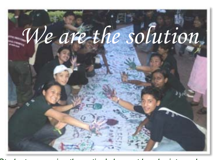
Students preparing the nation's longest hand print eco-banner

The activities of National Green Corps programme being implemented by school eco-clubs and coordinated by the ENVIS Centre under Forest, Environment & Wildlife Management Department for stimulation of environment awareness has been appreciated as the Greenest of Greens in the first ever National Conference of Children and Youth held at Hyderabad, Andhra Pradesh from Aug 25-30, 2010 where 21 States participated.