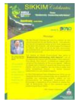
World Environment Day 2010